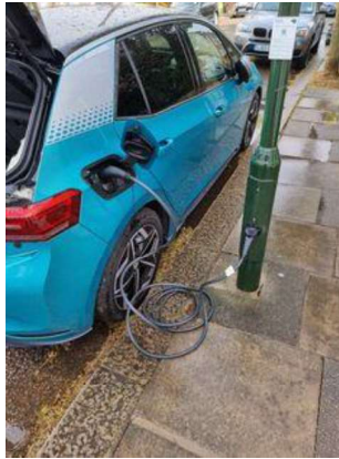
suitably modified lampposts and